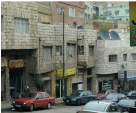
Fig.3: Stone used in building

Interviews reveal that the illegal homeowner prepares building materials him/herself using family money and arranges their transport to the site, while the master mason and his workers perform the actual construction. Cement, iron, stone and bricks are the most commonly used materials in building. 43.4% of respondents used yellow and white stone in building their properties (Fig: 3). In general, stone is used as a popular structural component, while cement is used to fill in the space between acting as a type of concrete and insulation. The amount of cement used in construction is estimated by the master mason's experience, rather than engineering estimators. However, many houses were built using iron and brick.