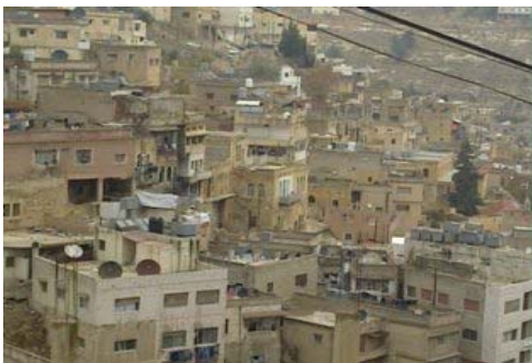
Fig. 5: Vertical Pattern of Construction

Findings reveal that vertical pattern was often taken place (Fig: 5). It seems to be that vertical pattern happens when the plot size is limited. In most cases, vertical pattern is cheaper than horizontal. These results agree with Kombe's argument (2005) in which both vertical and horizontal patterns of illegal housing are prevailing in developing countries. In Wadi Al-Akrad, the homeowner initially constructs two or three rooms horizontally and later on adds other rooms vertically after attaining sufficient financial resources. This agrees with theoretical argument by Fekade (2000) which describes the pattern of illegal housing as not growing consistently or systematically over time.