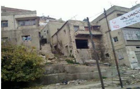
Fig.4: Construction approach in Wadi Al-Akrad

Interviews' findings show that construction begins building foundations followed by the ground floor which has to accommodate a large family. The floor space is divided into separate rooms. The importance is given to the reception area which is characteristically large to reflect the habits of hospitality. Rooms are big enough to accommodate the furniture. This fact is confirmed by 78.3% of respondents. However, 82% of respondents said that they had 4 and/or 5 rooms within the house. Spaces are required for the bathrooms and kitchens which are normally small or medium sized. 88.6% of respondents reported that they had no complete bathroom consisting of a bath or a shower and toilet in their houses. However, all houses were found to have kitchens as a separate unite within the house. A sitting room is often constructed in the heart of house which completely differs from the main reception room. Small balconies are usually built. Ventilation spaces between houses are not in existence and, thus, the amount of light received is limited and inadequate. No green spaces around the houses, and children often play in the street as a result (Fig: 4).